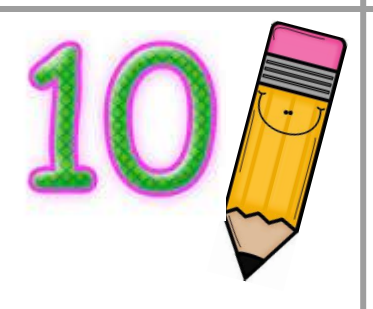
I can write numbers 0-10!