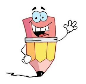
I can write my name!