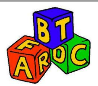
I can name 14 uppercase letters!