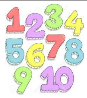
I can identify numbers 0-10!