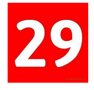
I can count 1-29!